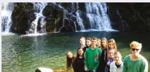
Owharoa Falls - Karangahake Gorge