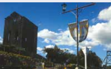
Waihi - New Zealand's Heart of Gold