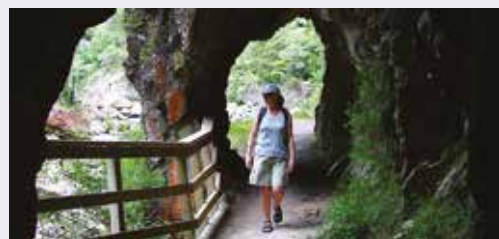
Windows Walk - Karangahake Gorge

Waihi - New Zealand's Heart of Gold has a rich and fascinating history which includes over 100 years of gold mining. Today, mining operations exist alongside fascinating reminders of our golden heritage. The breathtaking Karangahake Gorge and the golden sand of Waihi Beach are just a few of the natural attractions we enjoy while we also cater for sport, recreation and the arts. Our area also boasts a diverse range of businesses including tourism, dairy and dry-stock farming and manufacturing.