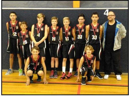
The Waihi teams played against the U11 and U12 Rep teams from Tauranga and also a Rep team from Coast Basketball.

Congratulations boys on taking out the Waihi Blitz Tournament. Also to our other three teams who played some awesome basketball!