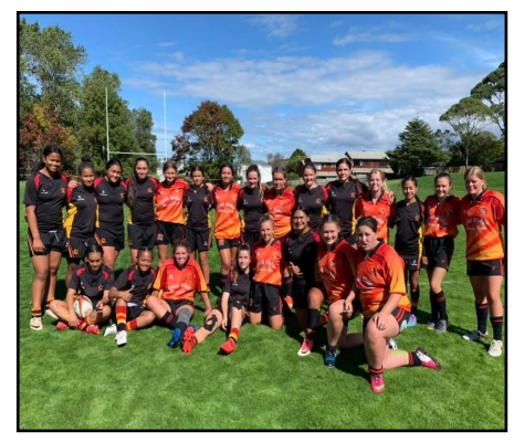
played their hearts out all day and showed great courage.